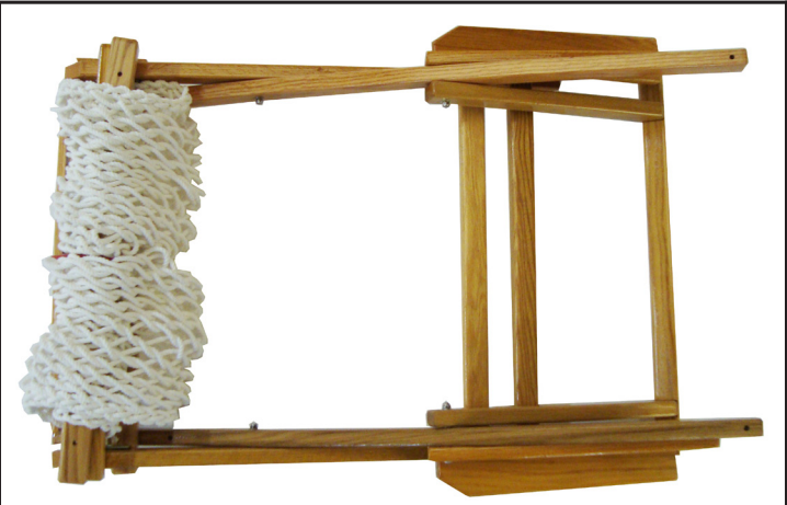
1 Pre-Assembled Chair Body